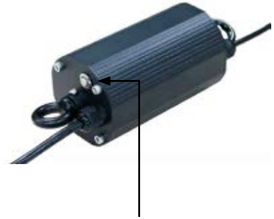
Interruptor de prueba e indicador de carga Test switch and charge indicator Interruptor de teste e indicador de carga